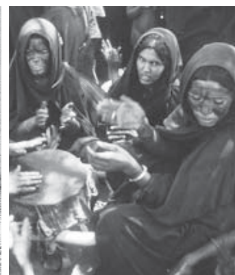
Left to right: Kamale n'goni players; Jeli musicians playing sokos; women playing tende drum.

Mali has a rich musical heritage that includes a variety of traditional music from different regions in West Africa. Many of Africa's most famous musicians like Salif Keita, Habib Koité and Oumou Sangaré come from Mali and draw their music from this distinctive legacy.