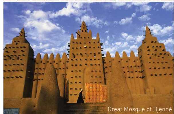
Great Mosque of Djenné