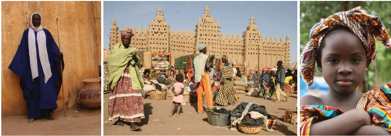
Left to right: Tuareg man in front of mosque; Market center at the ancient city of Djenné; Banana girl from Bamako