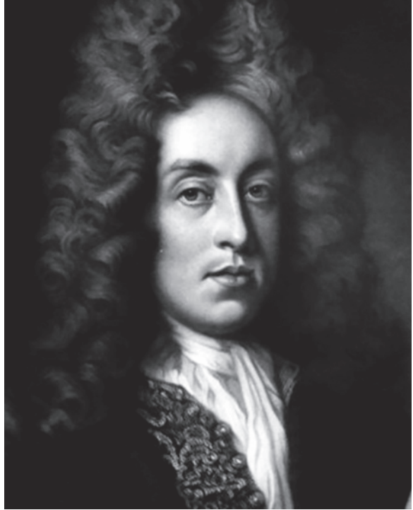
Portrait of Henry Purcell by John Closterman

Purcell lived and worked in a country in which all cultural customs had been changed by 10 years of Puritan dictatorship. When Charles II came to the throne in 1660, he found a people who had remained a musical one, but who lacked both trained composers and good practicing musicians. During his exile, the King had acquired a taste for continental fashions, and it was quite natural for him to take Paris and Saint-Germain as the models for the musical institutions of his own Court. As for the Anglican Church, it returned to the practices