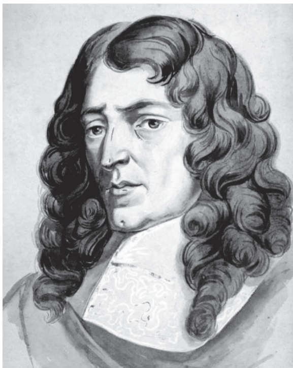
Portrait presumed to be of Marc-Antoine Charpentier

What is certainly to be found is a desire for color, which should characterize each scene of this pastorale. The difference between the first two scenes is clearly defined by the use of the keys of D Major and A Major. In the little treatise written for the future Regent, the Duke of Orleans, Charpentier invests keys with certain qualities: D Major is “joyful and warlike,” A Major is “joyful and rural.” This search for color is constant in each of the scenes. The fourth is very curiously composed of a recitative of Actéon (who has just been transformed into a stag) and a long plaint in C minor (“obscur et triste”). The listener will be struck, as well, by the various ways in which Charpentier sets the words to music. There are, in fact, very few true recitatives. On the other hand, one notes the frequency of melodic passages, interestingly constructed ensembles such as Arthebusia’s air alternating with the chorus, Actéon’s long monologue (Scene 3), and the