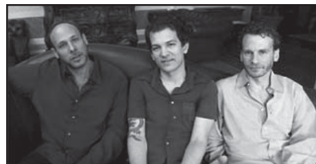
(l-r: Jeff Ballard, Brad Mehldau, Larry Grenadier)

Cal Performances thanks our Centennial Season Sponsor, Wells Fargo.