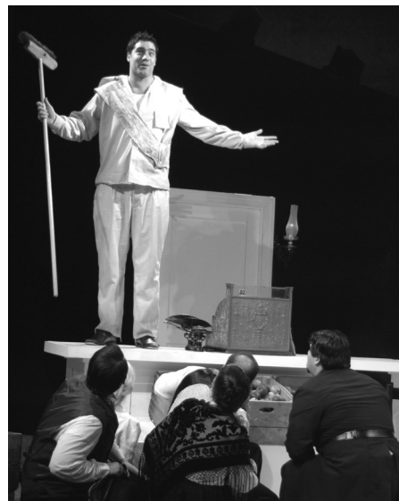
Albert Herring (1946–1947)

Cal Performances' 2010–2011 season is sponsored by Wells Fargo.