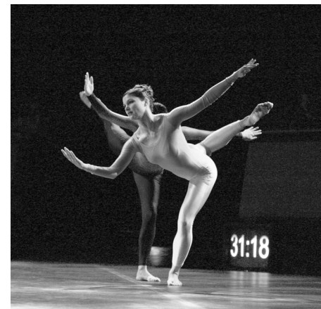
Merce Cunningham Dance Company in Ocean , Harmon Gym, April 1996

APRIL 1985 Doubles , Native Green , Phrases , Pictures , Quartet , Roadrunners