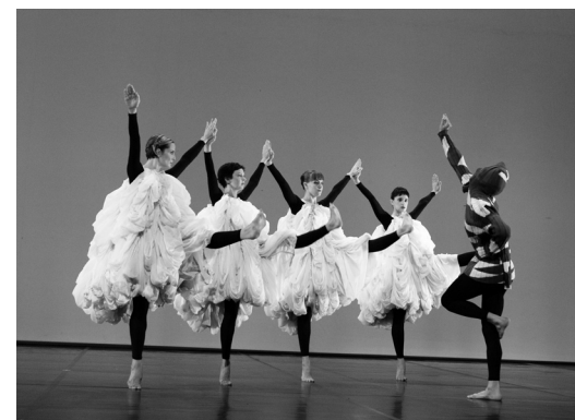
The Company in Antic Meet .