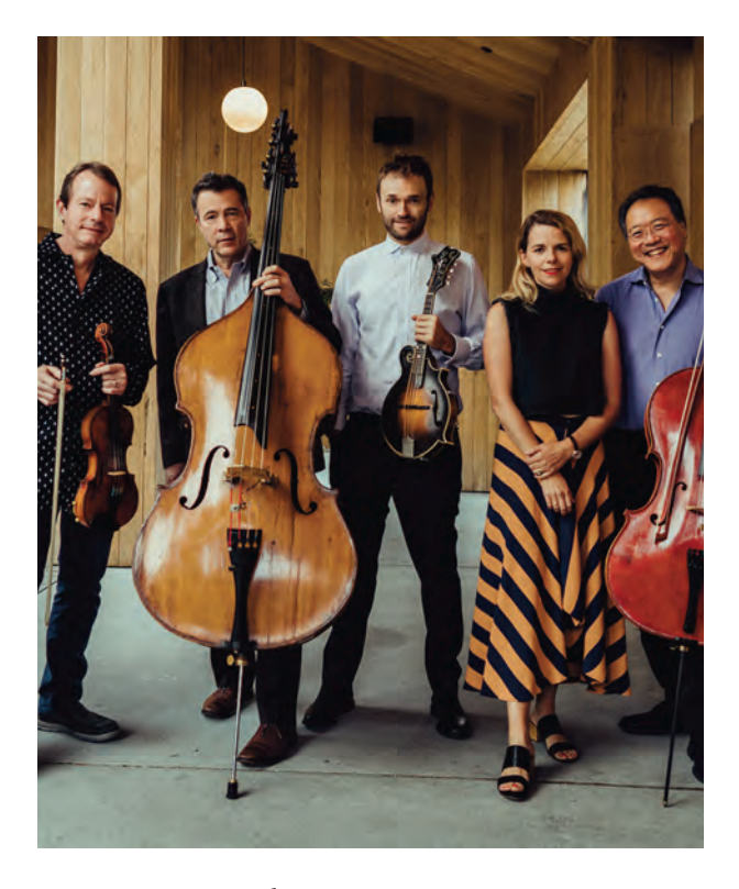
Saturday, August 21, 2021, 8pm Greek Theatre