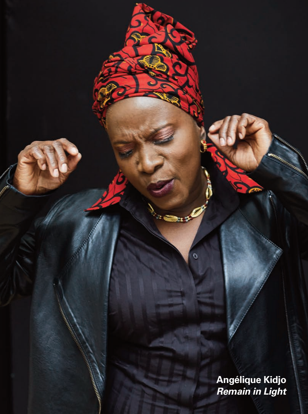
Angélique Kidjo Remain in Light