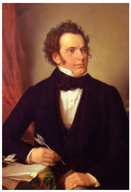
Oil painting of Franz Schubert by Wilhelm August Rieder (1875), made from his own 1825 watercolour portrait