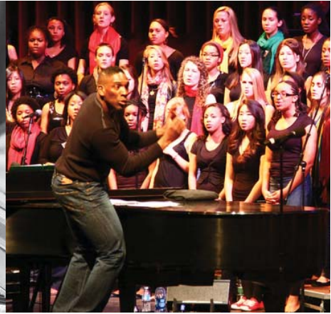
Darmouth College Gospel Choir