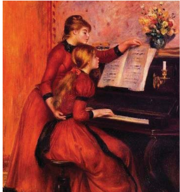
Piano lessons were encouraged from a young age, and many women worked as piano instructors.