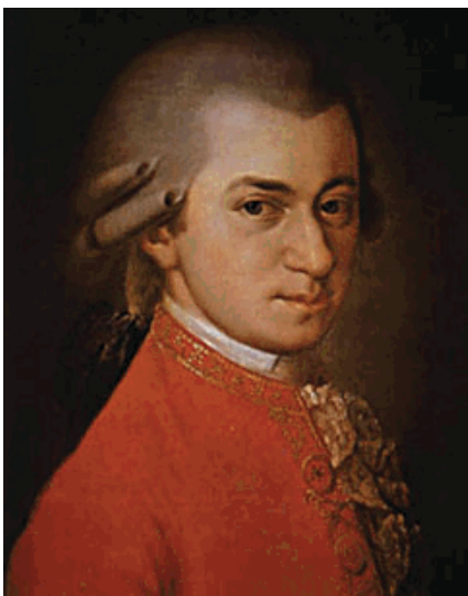
Wolfgang Amadeus Mozart

The first piano was invented in Florence, Italy in 1700 by Bartolomeo Cristofori (1655 – 1731), a craftsman who repaired harpsichords for Italy's royal court. Cristofori's invention was a simple keyboard that he called a gravecembalo col piano et forte , "keyboard instrument with soft and loud," named for the strings that produced different dynamic levels upon vibrating when struck by small wooden hammers covered with deerskin. Cristofori experimented with the instrument's design throughout the years, and the instrument grew popularity among the upper class. By 1730 pianos were purchased and played by the most elite Europeans.