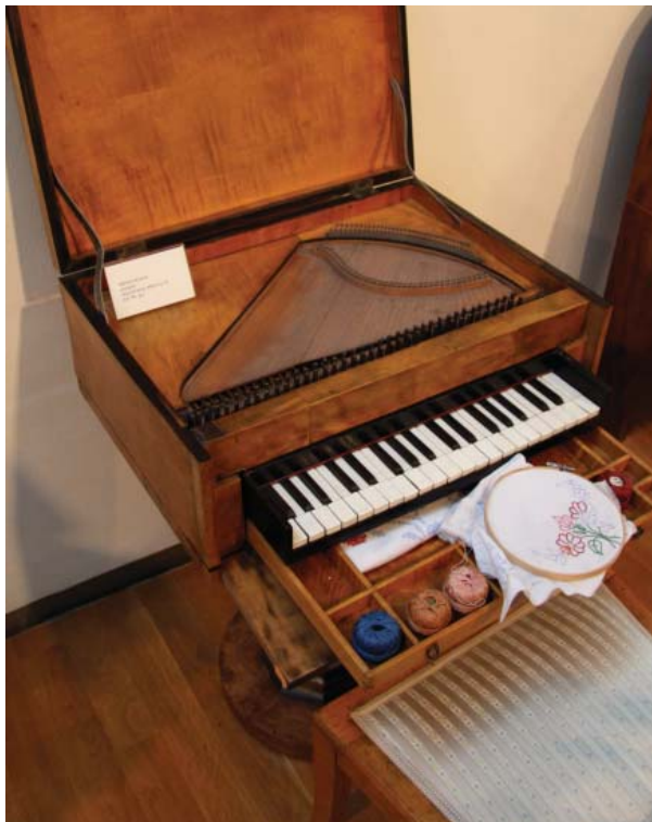
Sewing machine with built in piano from Austria at the Music Instrument Museum in Berlin.

his works. Although public performances by women pianists were frowned upon, women were still expected to play the piano at home and teach their children how to play. As a result, many American women worked as piano instructors. In Germany and Australia, pianos were even built into sewing tables, allowing women to conveniently practice both “womanly” tasks.