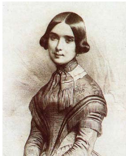
Marie Moke Pleyel

In the 19th century, women were often shunned for playing the piano in public, but there were a few exceptions. Parisian Marie Moke Pleyel