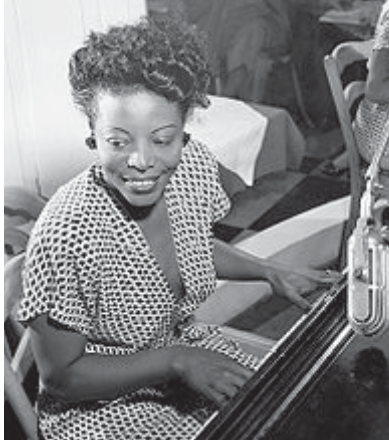
Mary Lou Williams