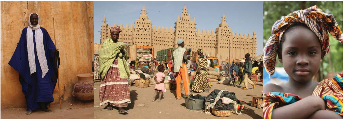
Left to right: Tuareg man in front of mosque; Market center at the ancient city of Djenné; Banana girl from Bamako