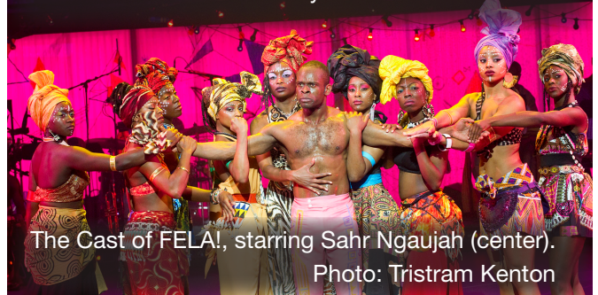
The Cast of FELA!, starring Sahr Ngaujah (center).