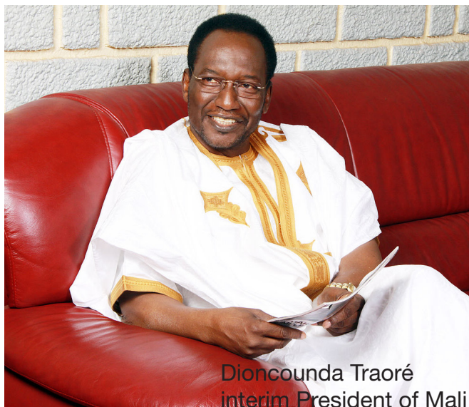
Dioncounda Traoré interim President of Mali

Republic of Mali was formed. In 1968, military dictator Moussa Traoré removed Mali's first president, Modibo Keita in a coup. Traoré ruled until his overthrow in 1991, at which time a new Malian constitution was written and a multi-party political system emerged. Alpha Konaré became Mali's first democratically elected president in 1992.