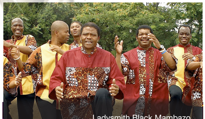
Ladysmith Black Mambazo