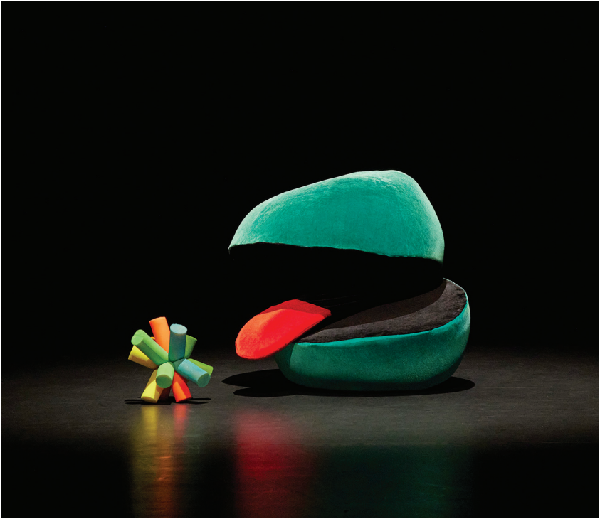
Opposite: Mummenschanz.