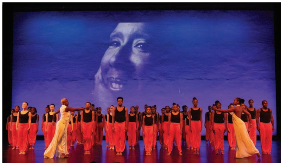
Myles Beyond Entertainment